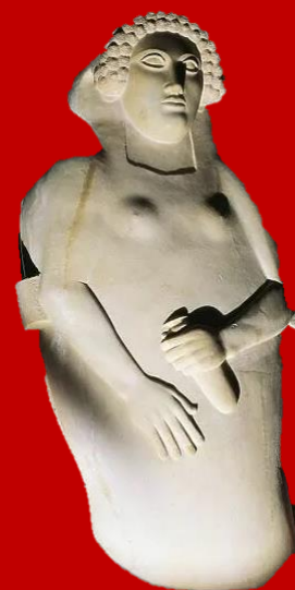
Sarcophagus of a woman in alabaster found in Cadiz, Phoenician art, V/IV century BC. Cadiz Museum (Spain)