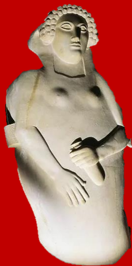
Sarcophagus of a woman in alabaster found in Cadiz, Phoenician art, V/IV century BC. Cadiz Museum (Spain)

As part of the initiative of the Apulia Region in favour of the Phoenicians' Route, the event "From the Route to the Territory - Creative Workshops of the Phoenicians' Route in Apulia" took place in Bari, Fiera del Levante, on July 11th and 12th. On the first day, a "Public meeting with cultural and tourism stakeholders of the Apulia Region and selected international tour operators" took place to plan the development of the Phoenicians' Route in Apulia, according to the typical methodologies of the Route, in particular the Smart Ways system. In the afternoon, a "Meeting reserved for Italian public bodies adhering to the Phoenicians' Route" was held to discuss the strategies for Italy for the period 2022-2025: governance, ideas, projects, and visions, also in view of the celebrations of the XX Anniversary of the Phoenicians' Route in 2023. On the morning of July 12th, a public meeting of the Apulian universities with the International Network of Universities (IUN) of the Phoenicians' Route was aimed at the exchange of methodologies and best practices. In the afternoon, a "Workshop on Cultural Routes for the definition of guidelines to set up the Atlas of Cultural Routes of the Apulia Region".