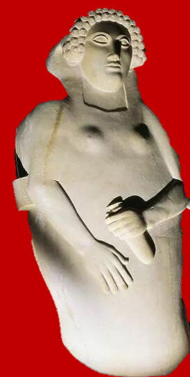
Sarcophagus of a woman in alabaster found in Cadiz, Phoenician art, V/IV century BC. Cadiz Museum (Spain)

On September 20th and 21st, Castelvetro and Selinunte hosted the last transnational meeting of the European project “THE FAB ROUTES: Digital Skills to Promote Eu Cultural Routes”, co-financed by the Erasmus+ programme of the European Union. Among the partners, the project includes the Phoenicians' Route and 5 other Cultural Routes of the Council of Europe, in addition to the University of Bologna – Rimini Campus, leader in the sector, and the company Argo, European consulting and International Cooperation. During the meeting, the project partners visited the Archaeological Park of Selinunte, Cave di Cusa and Pantelleria (welcomed by its director), the Official Library of the Phoenicians' Route in Castelvetro, at the Mondadori Bookstore; the Interpretation Centre on Olive oil and olive trees at Case di Latomie – Azienda Agricola Centonze (as part of the collaboration between The Phoenicians' Route and the Routes of the Olive Tree), and the Mandrarossa Winery, Interpretation centre in collaboration with Iter Vitis.