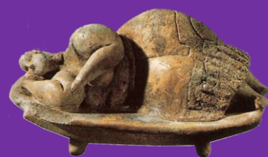
Mother Earth - Malta