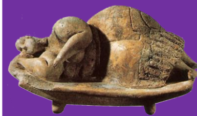
Mother Earth - Malta